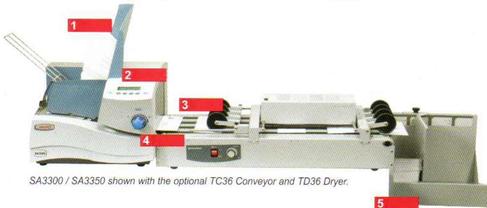
SA3300 / SA3350 shown with the optional TC36 Conveyor and TD36 Dryer.

Personalized Message Lines for Greater Attention and Impact